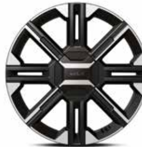
20" Machined Face Wheels (GT-line Exclusive)