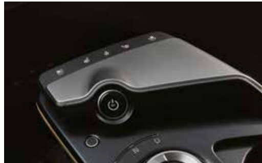
Center Console Touch Switch