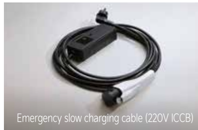
Emergency slow charging cable (220V ICCB)