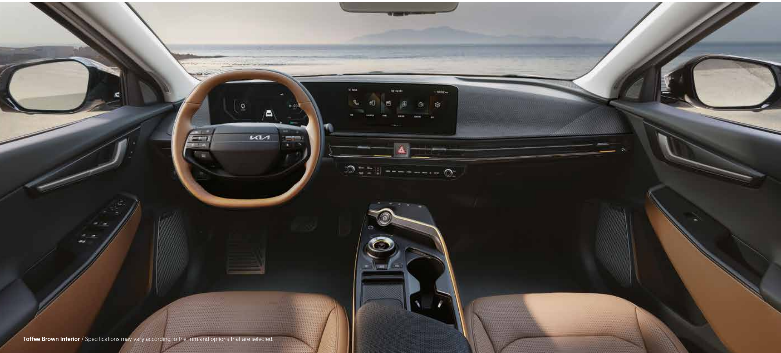
Toffee Brown Interior / Specifications may vary according to the trim and options that are selected.