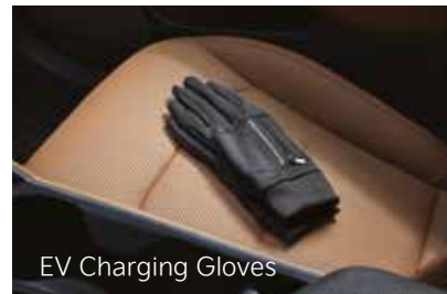
EV Charging Gloves