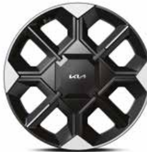
20" Machined Face Wheels