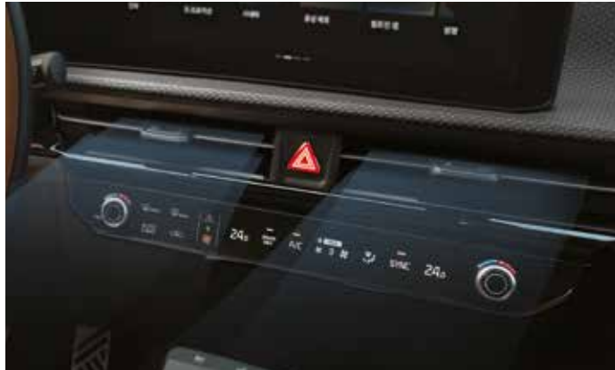
Air Conditioner Photocatalytic Sterilization System*