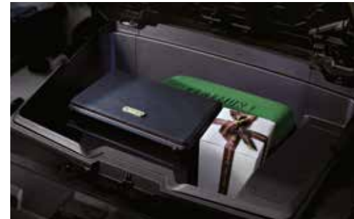
Front Trunk (2WD)