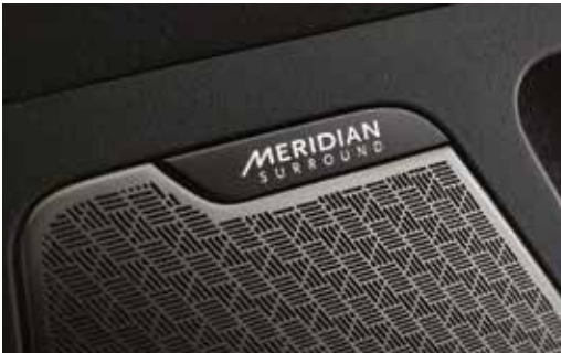
Meridian Premium Sound (14 speakers, external amplifier)