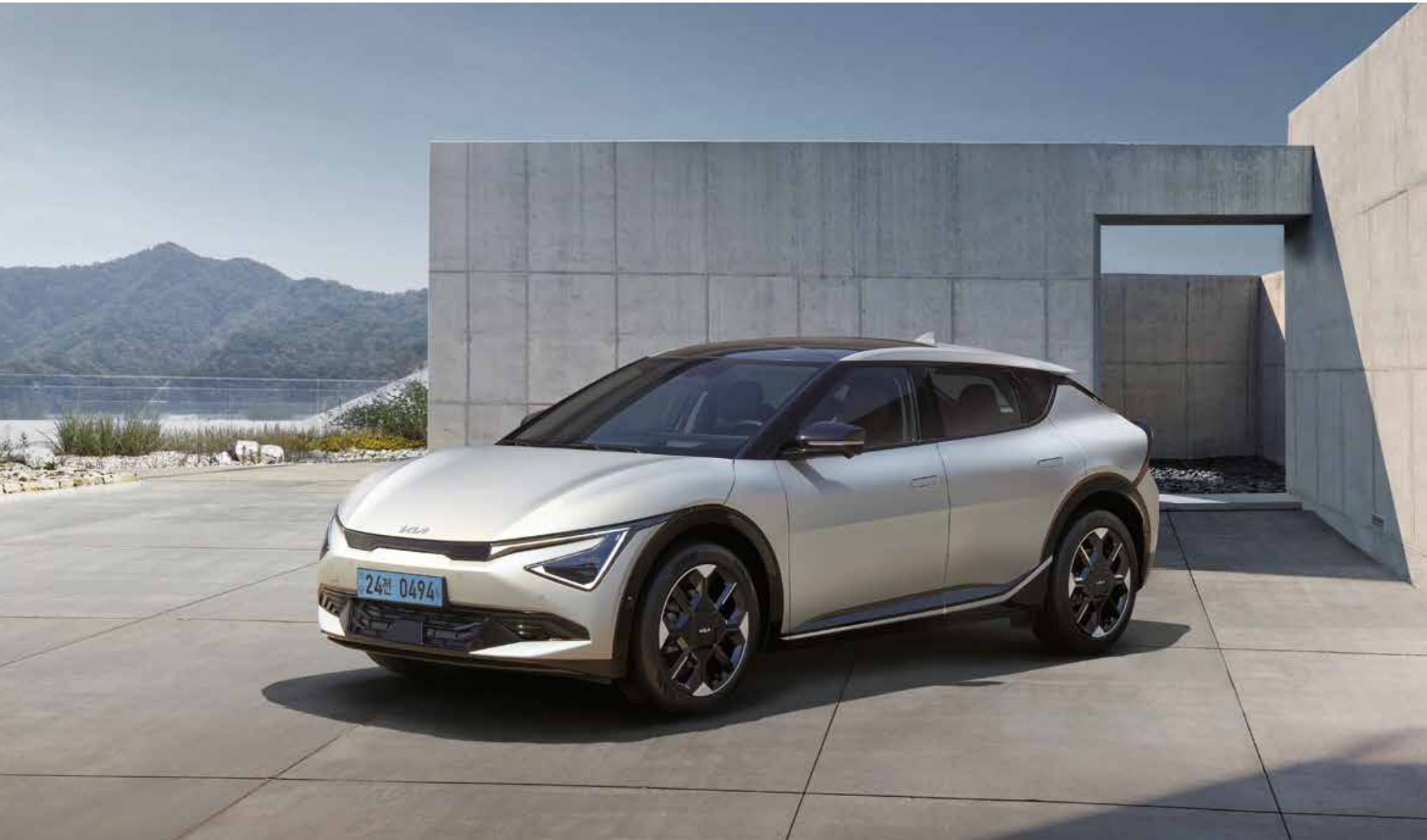
Long range 4WD _ Ivory Matte Silver / Specifications may vary according to the trim and options that are selected.