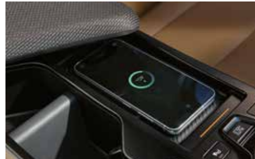
Smartphone Wireless Charging System