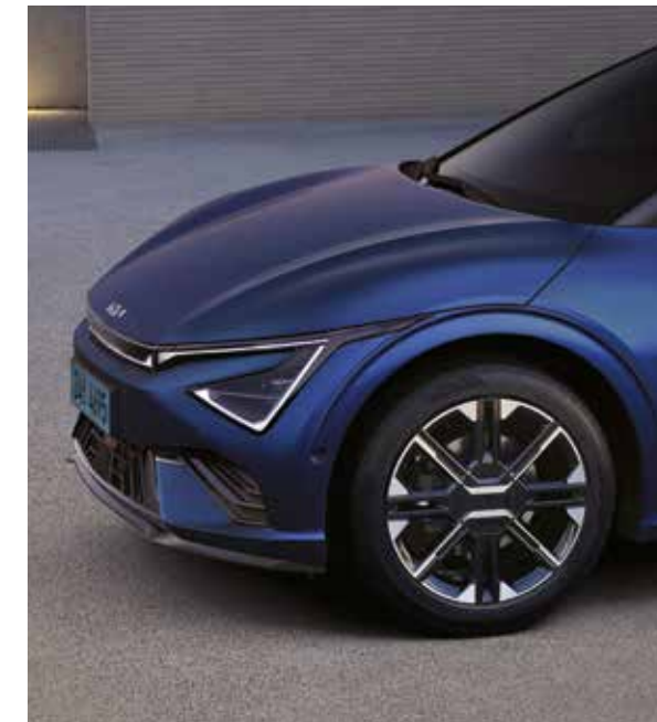
GT-line Exterior Design

Define your unique personality with sporty and powerful elements.