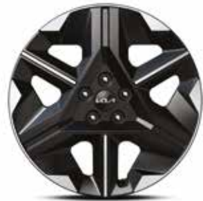
19" Machined Face Wheels