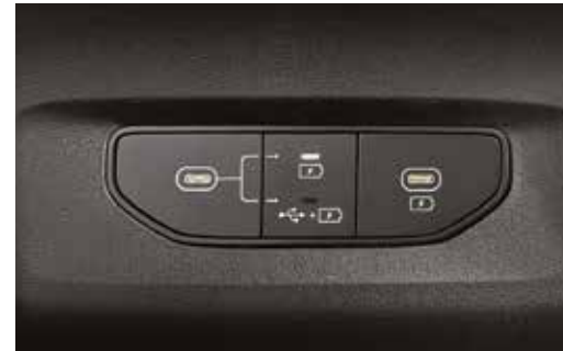
Data/Charging Switch USB Socket