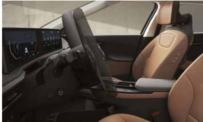
Electrically Tilting & Telescoping Steering*