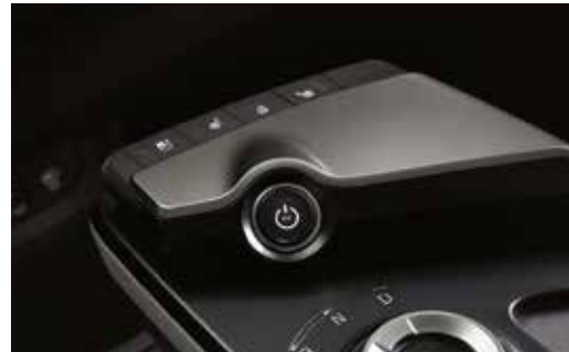
Center Console Button Switch