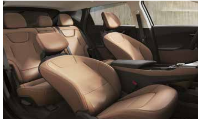
Front Relaxation Comfort Seat