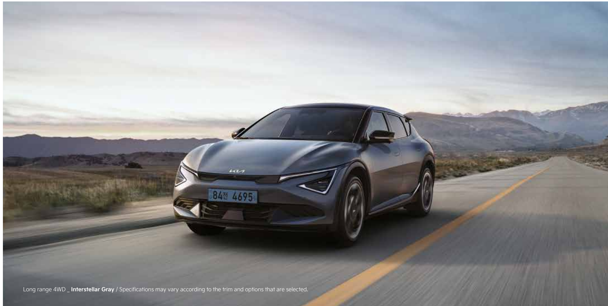
Long range 4WD _ Interstellar Gray / Specifications may vary according to the trim and options that are selected.

Greater stability in handling and lower noise levels increase the fun of driving.