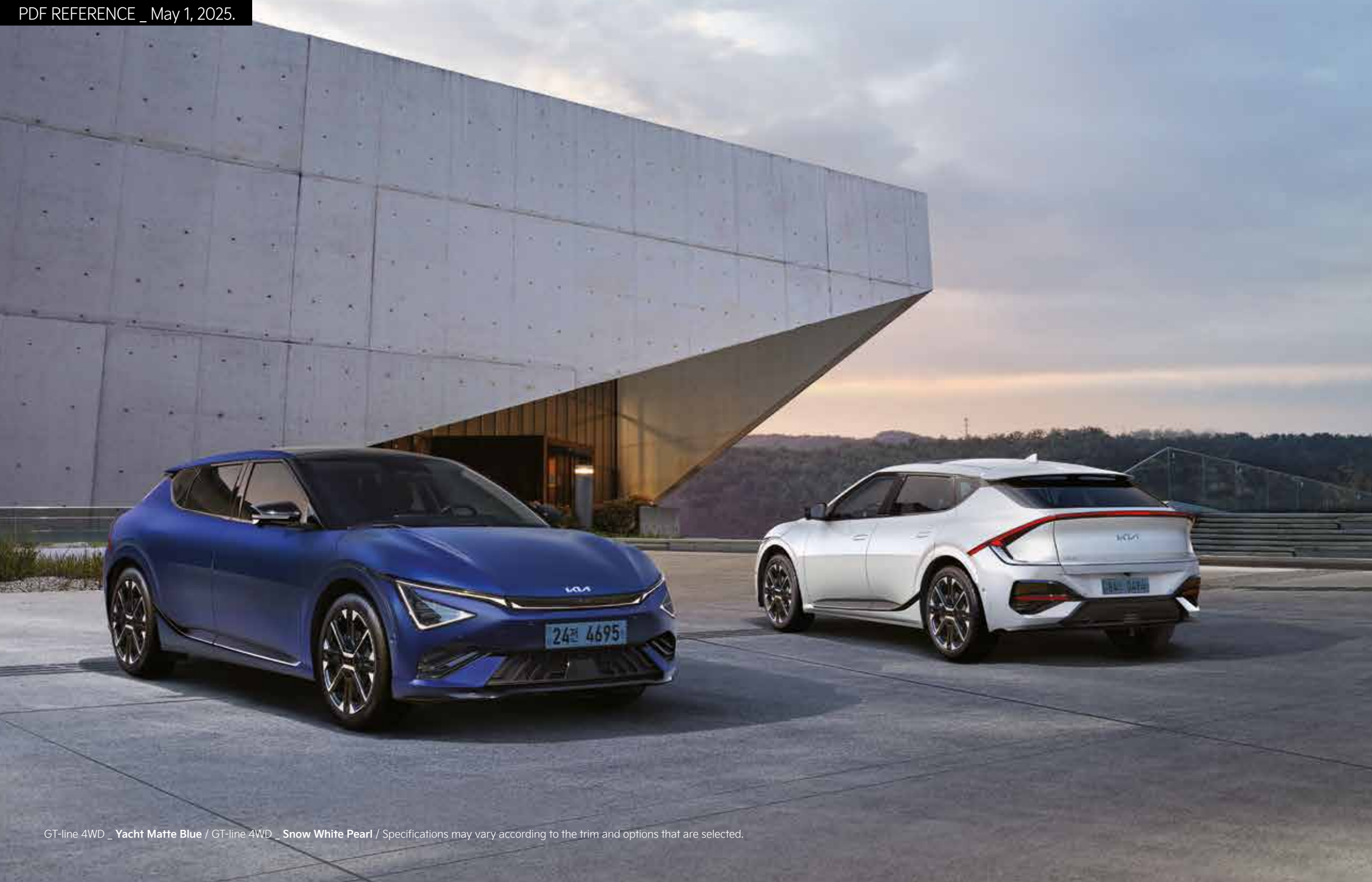
GT-line 4WD _ Yacht Matte Blue / GT-line 4WD _ Snow White Pearl / Specifications may vary according to the trim and options that are selected.