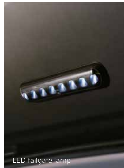
LED tailgate lamp