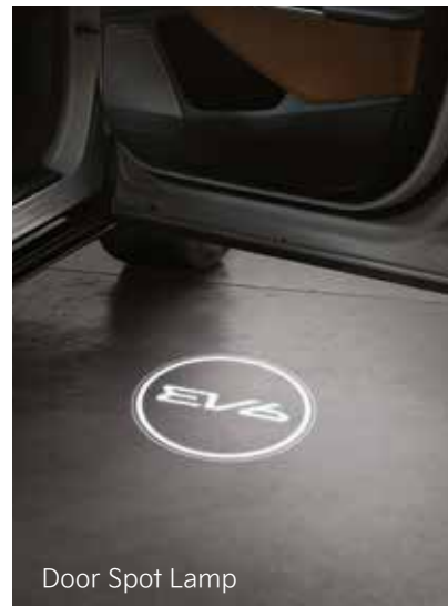
Door Spot Lamp

Specifications may vary according to the trim and options that are selected.