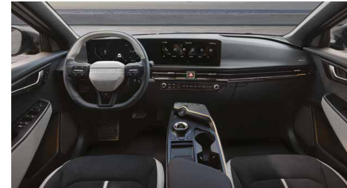
GT-line Interior Design

The exclusive bumpers and wheels, body-colored wheel cladding, and front LED center positioning lamp highlight the differentiated identity of the GT-line.