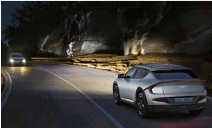
Intelligent Headlamp (IFS)