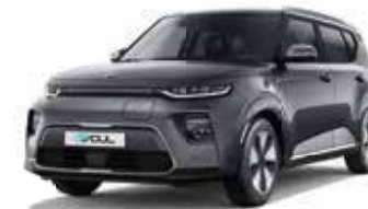
Gravity Grey (KDG)