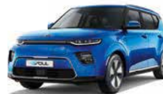
Neptune Blue (B3A)