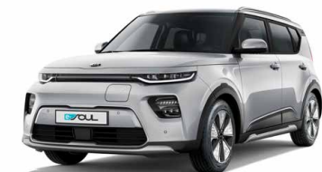
Sparling Silver (KSC)