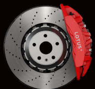
6-PISTON - FRONT RED CALIPERS LIGHTWEIGHT BRAKE DISCS