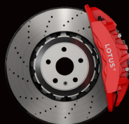
6-PISTON - FRONT RED CALIPERS LIGHTWEIGHT BRAKE DISCS