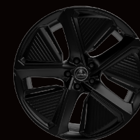
21" 5-SPOKE AERO* GLOSS BLACK