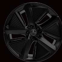
21" 5-SPOKE AERO GLOSS BLACK