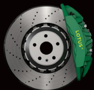
6-PISTON - FRONT GREEN CALIPERS LIGHTWEIGHT BRAKE DISCS