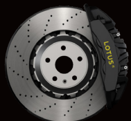
6-PISTON - FRONT BLACK CALIPERS LIGHTWEIGHT BRAKE DISCS