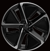
21" 5-SPOKE AERO* GREY