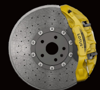
10-PISTON - FRONT YELLOW CALIPERS CARBON CERAMIC BRAKE DISCS