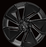
22" 5-SPOKE GLOSS BLACK WITH CARBON FIBRE