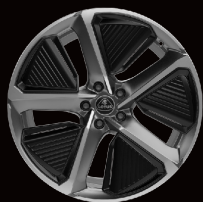
21" 5-SPOKE AERO SILVER