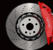
6-PISTON - FRONT RED CALIPERS LIGHTWEIGHT BRAKE DISCS