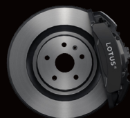
4-PISTON - FRONT GREY CALIPERS