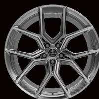
22" 10-SPOKE GLOSS SILVER