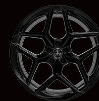
21" 10-SPOKE GLOSS BLACK