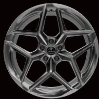
21" 10-SPOKE SILVER