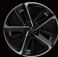
21" 5-SPOKE AERO GREY