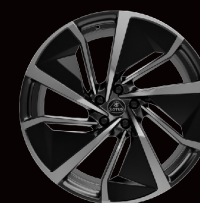
22" 5-SPOKE GLOSS GREY WITH CARBON FIBRE