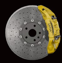
10-PISTON - FRONT YELLOW CALIPERS CARBON CERAMIC BRAKE DISCS