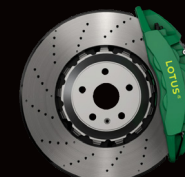
6-PISTON - FRONT GREEN CALIPERS LIGHTWEIGHT BRAKE DISCS