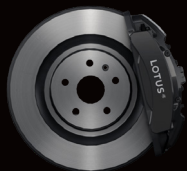
4-PISTON - FRONT GREY CALIPERS