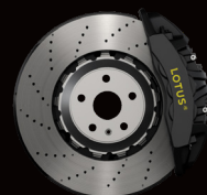
6-PISTON - FRONT BLACK CALIPERS LIGHTWEIGHT BRAKE DISCS