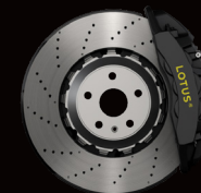
6-PISTON - FRONT BLACK CALIPERS LIGHTWEIGHT BRAKE DISCS