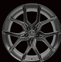
22" 10-SPOKE GLOSS GREY