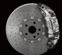
10-PISTON - FRONT SILVER CALIPERS CARBON CERAMIC BRAKE DISCS