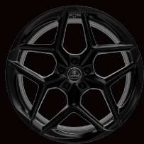
21" 10-SPOKE GLOSS BLACK