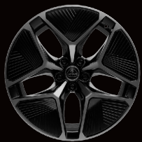
20" 5-SPOKE AERO GREY