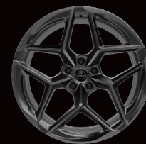
21" 10-SPOKE GREY